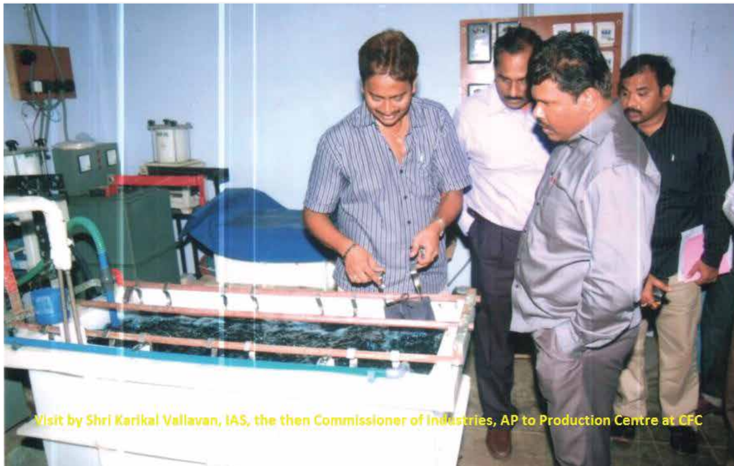
Visit by Shri Karikal Vallavan, IAS, the then Commissioner of Industries, AP to Production Centre at CFC