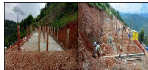
Foundation & Erection of Pillars in progress during September 2022