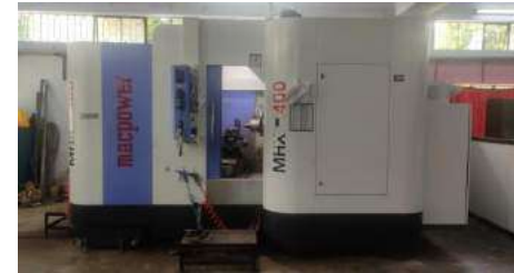
CNC Horizontal Milling Machine