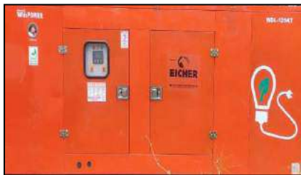
Diesel Generator Set (125 kVA)