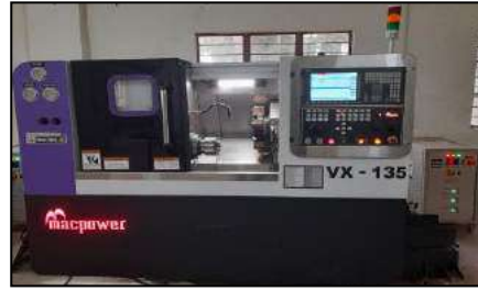
CNC Trainer Lathe