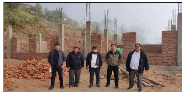
Inspection Team at the Project Site during November 2022