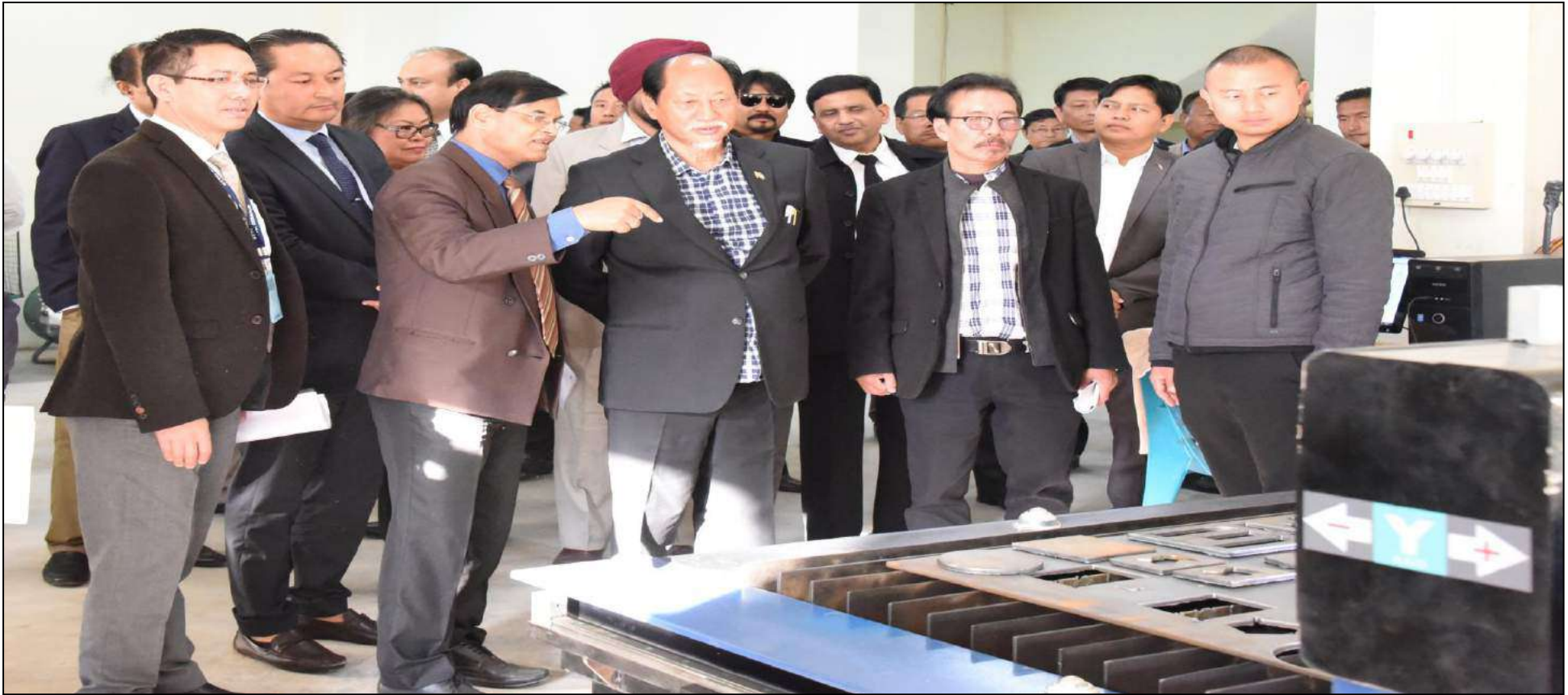
Shri. Neiphiu Rio along with other dignitaries been introduced to newly installed machines during the Inaugural Function of Modernization of NTTC on 8 th Dec. 2018.