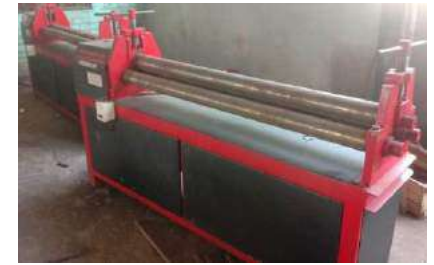
Metal Sheet Rolling