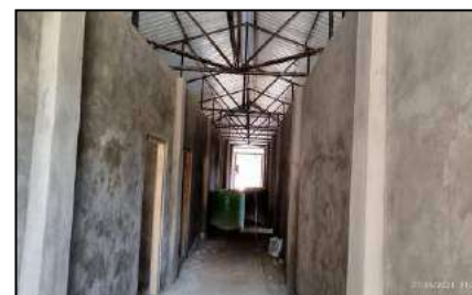
Construction of classroom, machine work in progress during end week of May 2023