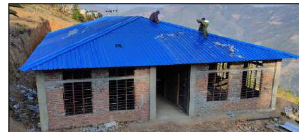
Construction of classroom, machine work in progress during March & April 2023