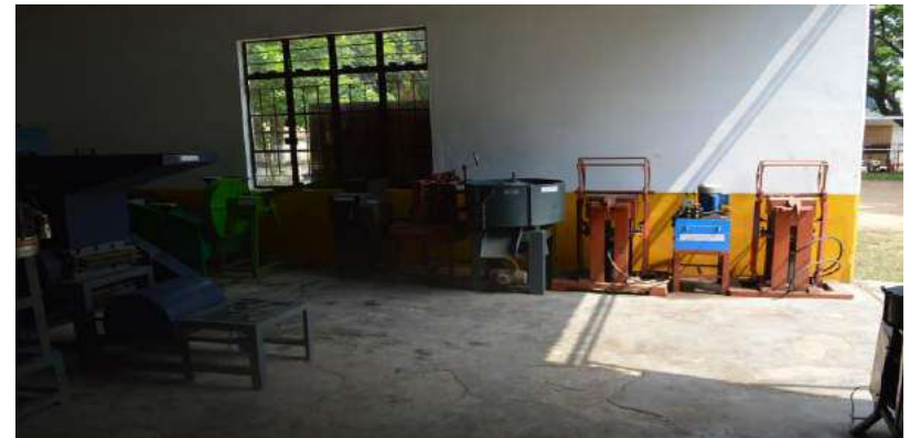
Concrete Block Making Machine.