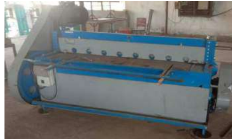
Mechanical under Crank Shearing Machine