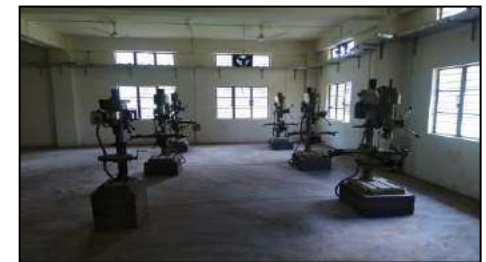
Vertical Milling cum Drilling Machi