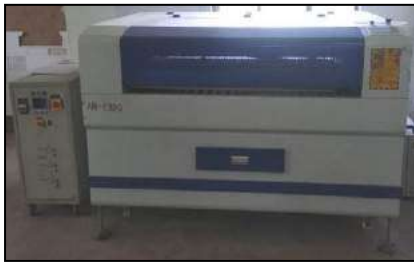
Laser & Engraving