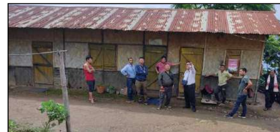
Joint Inspection by the Monitoring Committee members at the Project Site during June 2022