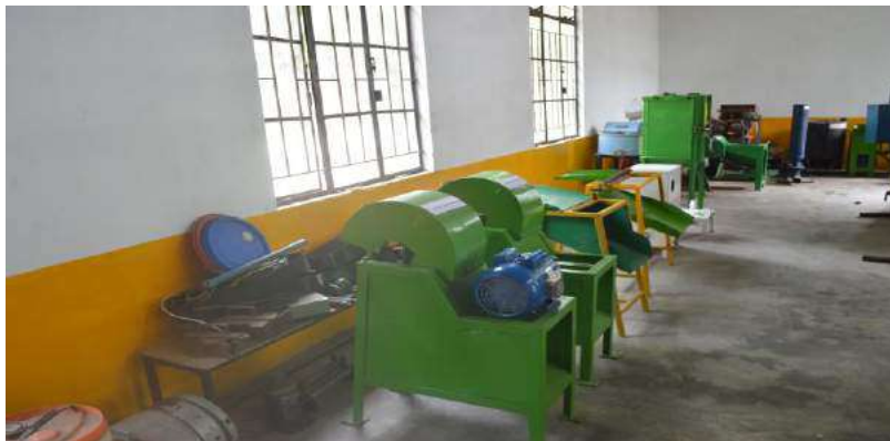
Banana Fibre Extractor and Chaff Cutter.