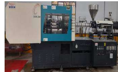
Injection Moulding Machine