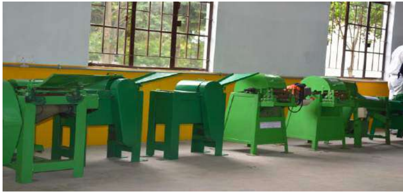
Pineapple & Banana Fibre Extractor