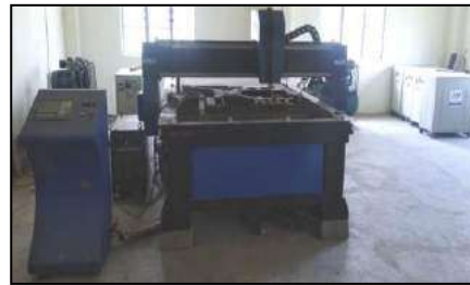
CNC Plasma Cutting Machine