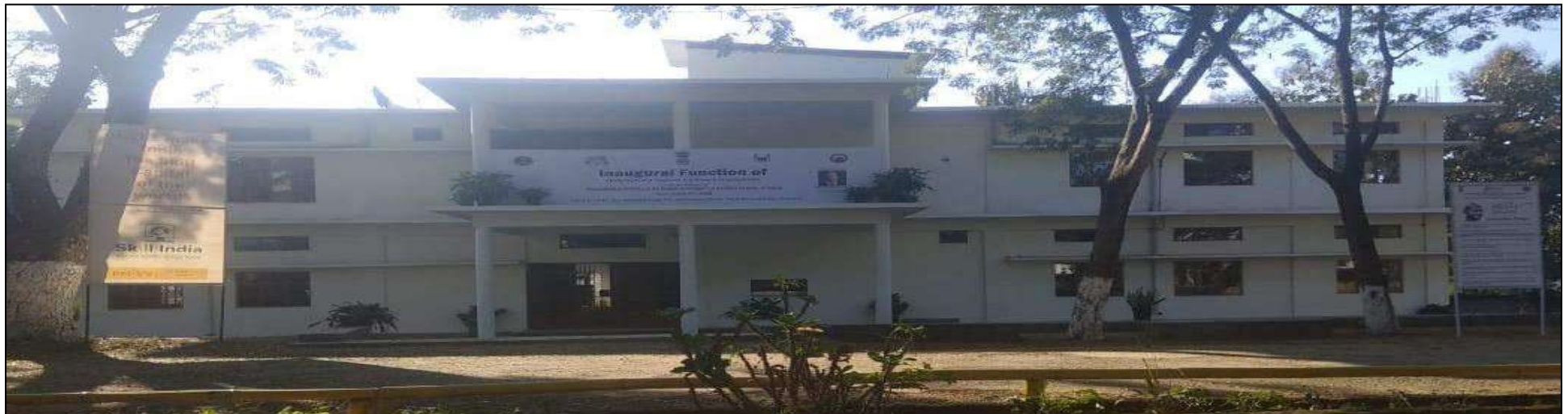
New building constructed under Upgradation/Modernization Project