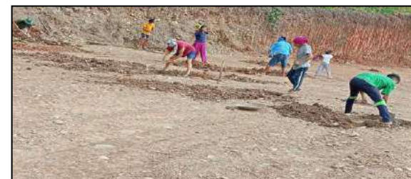
Site Leveling at the Project Site during July 2022