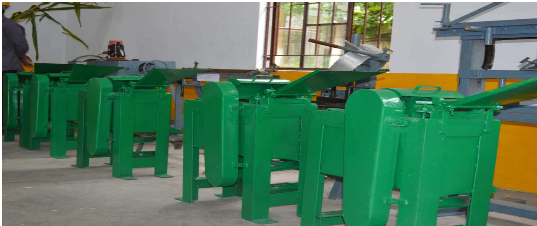
Pineapple Leaf Fibre Extractor