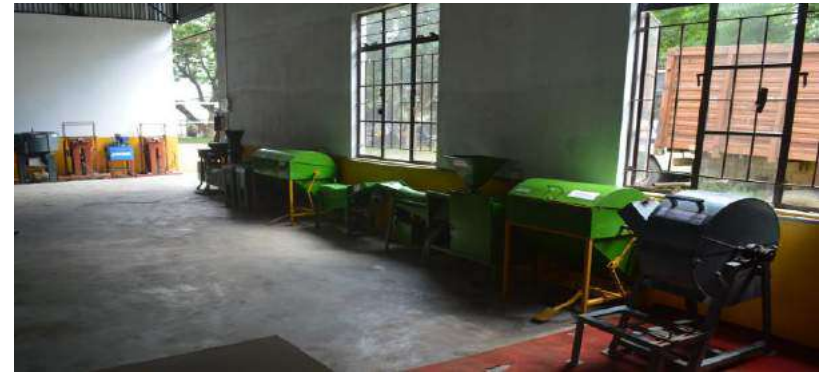
Paddy Thresher, Corn Sheller, Corn Mill and Fodder Cutting Machine.