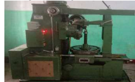
Gear Hobbing Machine