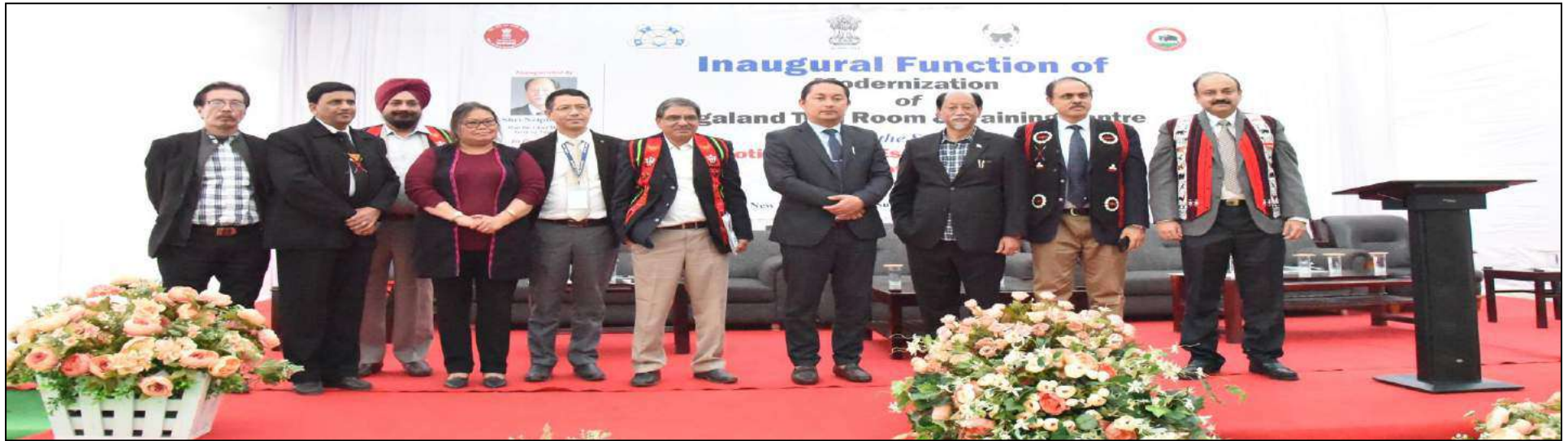
Shri. Neiphiu Rio, the Hon'ble Chief Minister of Nagaland, Shri. Imnatiba, Hon'ble Advisor, Ind. & Com. & NIDC. Dr. Arun Kumar Panda, Secretary, Ministry of MSME, Govt. of India along with other dignitaries posing for lens during the Inaugural Function of Modernization of NTTC on 8 th Dec. 2018.