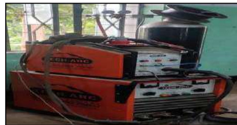
MIG Welding Machine