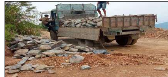
Constructional materials being transported at the Project Site during July 20