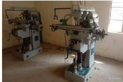
Horizontal Milling Machines