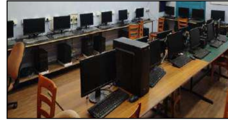
Installed & commissioned of IT Lab facility

Air compressors, Voltage stabilizers, CCTV Cameras were also purchased and installed.