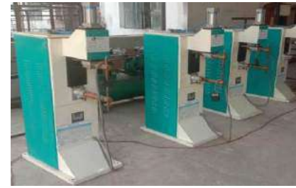
Spot Welding Machines